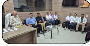
Optometry college faculty meeting to approve new syllabus