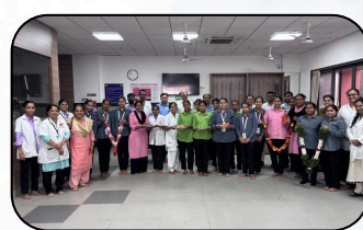
Aarti thali and har gunthan competition