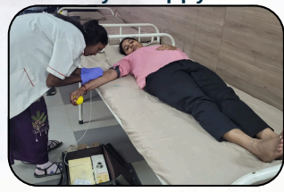
Blood donation camp