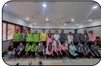
Mehandi competition participants