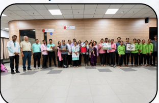
Best out of waste competition