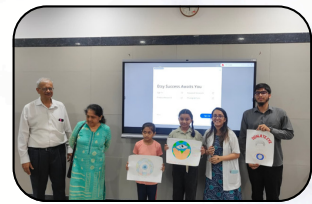
Drawing competition participants