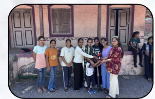
Cricket tournament - women's team winner