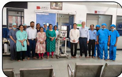
New Legion phaco machine installed - courtesy Macro Polymers, Ahmedabad