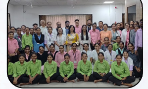
Antakshari competition participants