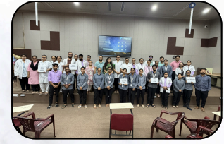
Quiz competition participants