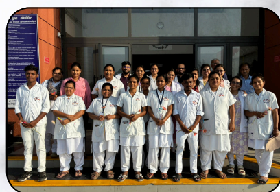
International nurses day celebration