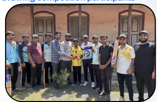
Cricket tournament - men's team winner